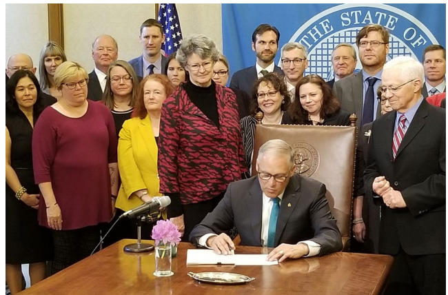
Gov. Jay Inslee signs Washington's landmark surprise medical billing law into effect in May 2019.

All state-regulated health plans must cover FDA-approved over-the-counter contraceptives and voluntary sterilization and vasectomies with no cost-sharing. Also, health plans must cover abortion services if it also covers maternity services and people cannot be denied reproductive health care based on their gender.