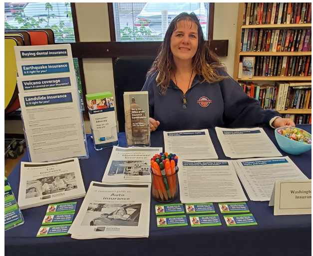
An OIC consumer advocate participates in an outreach event at a local library in 2019.

Consumers can contact our consumer advocates at 800-562-6900 or www.insurance.wa.gov .