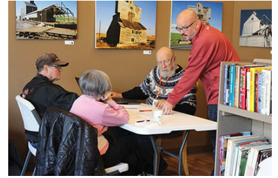
A SHIBA staffer and volunteer help Medicare beneficiaries at an outreach event in November 2019.

Washington state's SHIBA program inspired the federal government to create a national model, called State Health Insurance Assistance Programs (SHIP). In 1990, funding was authorized to create similar programs in all 50 states and Puerto Rico, Guam, Washington DC and the U.S. Virgin Islands.