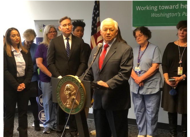
Commissioner Kreidler discusses Washington state's public health care option at a news conference in Seattle in January 2019.

From his local school district to the state Legislature and halls of Congress, Commissioner Kreidler has served Washingtonians for 48 years.