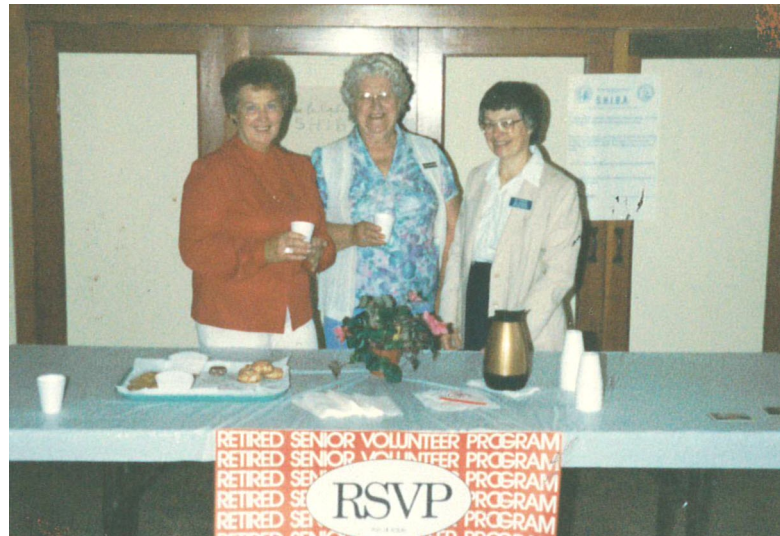
Skagit County volunteers celebrate incorporating with the Office of the Insurance Commissioner circa 1978.